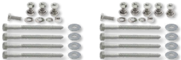
Standard Bracket Hardware Package