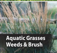
Aquatic Grasses Weeds & Brush